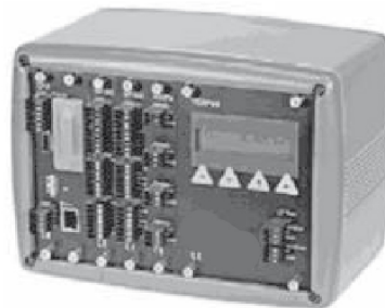
G4-RM DIN Rail Mount

All indicated data may be changed without notice. All the measures indicated are expressed in millimeters (mm).